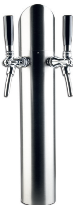
ART-LINE, straight, 2 lines 400 mm up to the tap drill-hole