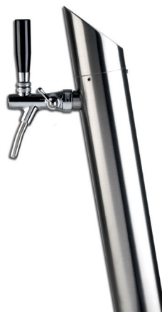
ART-LINE, tilted, 1 line 400 mm up to the tap drill-hole