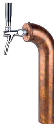
JOY 400 mm up to the tap drill-hole